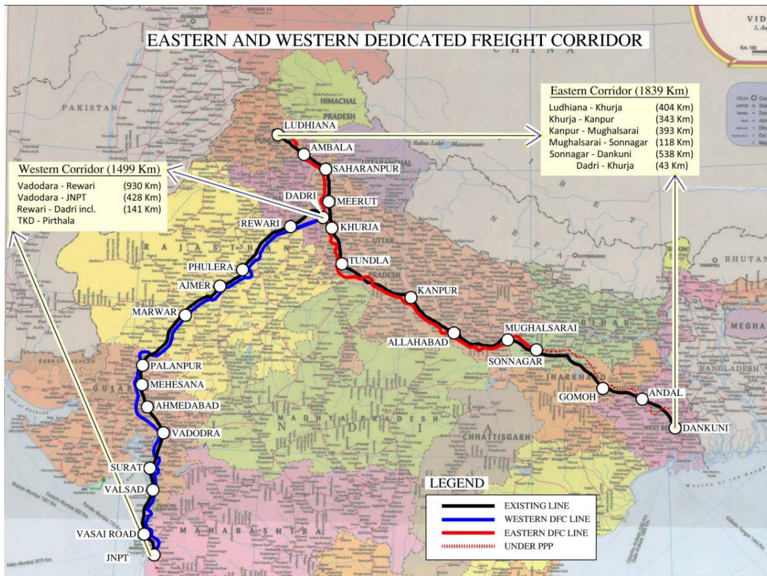
Fig 2: Eastern & Western Dedicated Freight Corridors