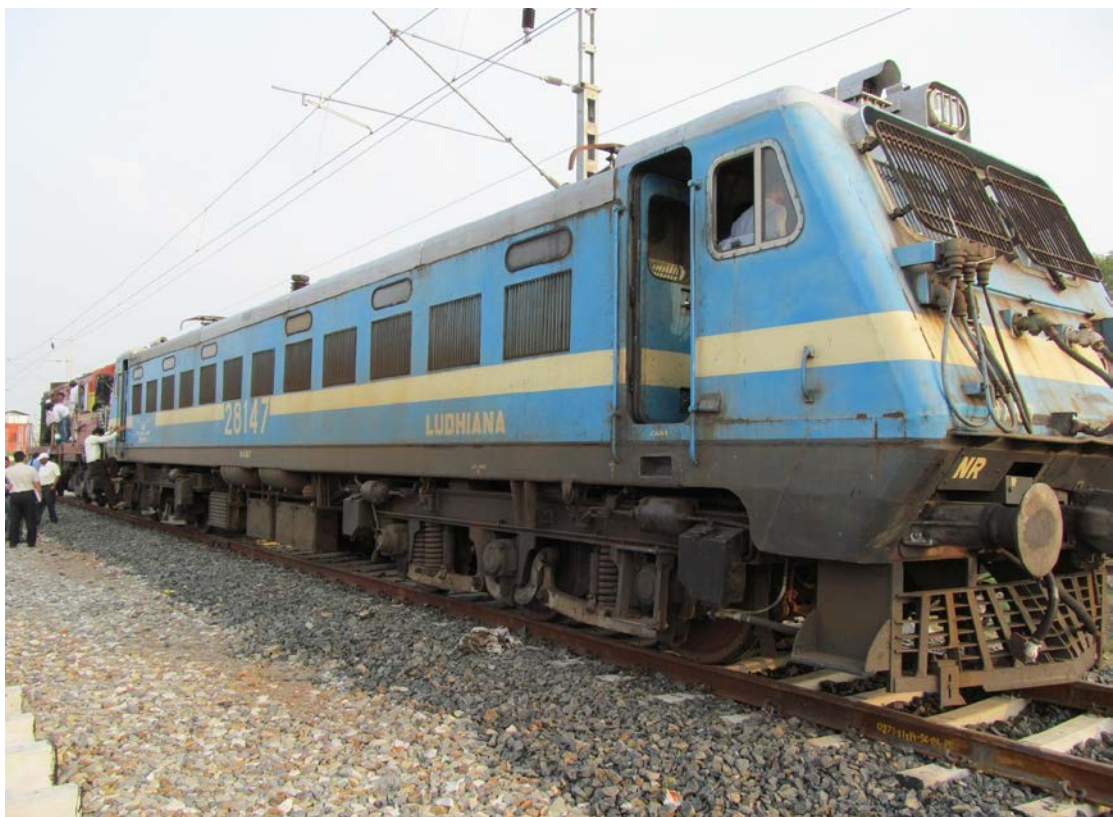
Fig 4: Trial run on Durgawati - Sasaram Section on 30.06.2015