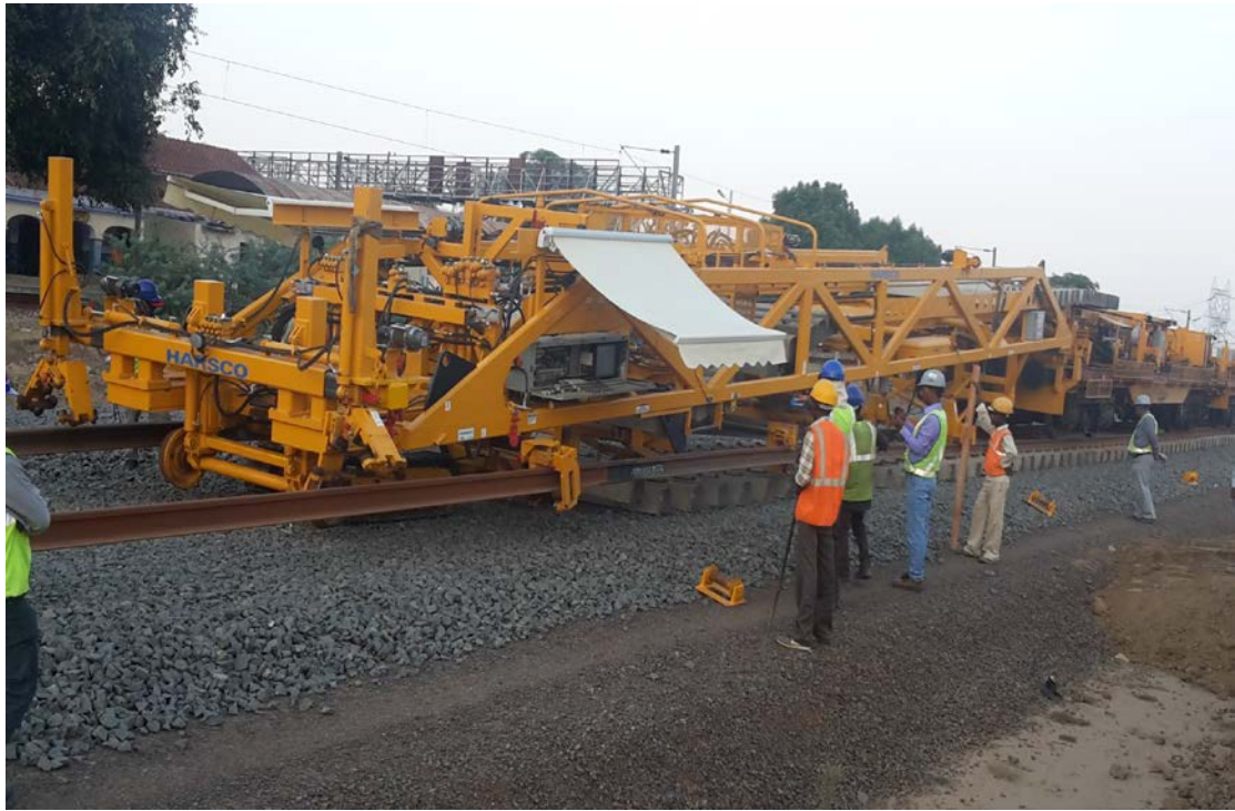
Fig 3: Track linking by NTC machine in progress